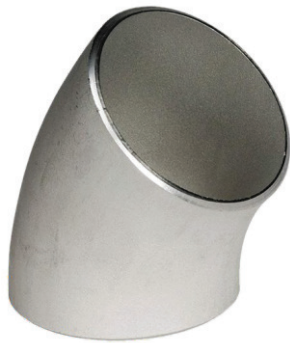
Curva 45° RL