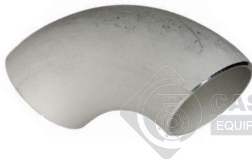
Curva 90° RL